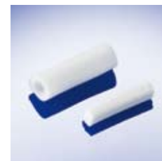
OTOCELL® Ear Wick, fenestrated