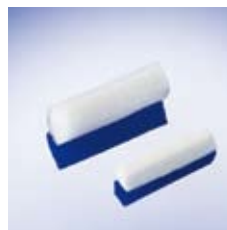
OTOCELL® Ear Wick, not fenestrated